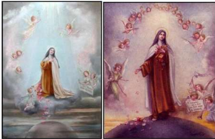
Figure 5.5-5.6. Left: Céline's 'Little apotheosis for the beatification' (1921). Source: ACL. Right: Céline's 'Little apotheosis for the canonisation' (1924). Source: ACL.

Notice, on the left portrait the angels surrounding her are presenting flowers from the earth to Saint Therese. The crucifix and roses are not included. In the portrait on the right, Saint Therese is showering the flowers back to earth and the angels are rejoicing. Notice that the crucifix and roses are now included.