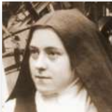
Novice at age 16

I was inspired to continue in this way since no statues were manufactured prior to her death and considering all the information I had, I now had to put everything in the proper order and perspective and that was to start after the death of Saint Therese.