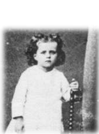
3 ½ yrs. old