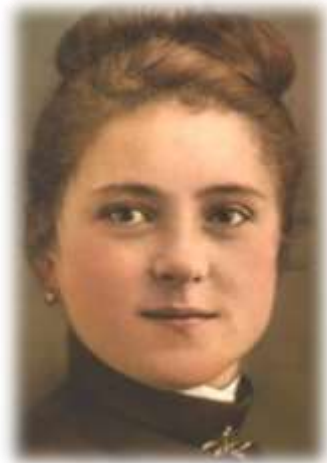
15 yrs. old

At this time I was thankful for all the information I had gathered. It was overwhelming, but there was still something missing. The information I had thus far did not tell me why this image was designed with two angels and without a crucifix and roses, where did this idea come from and how, when, and where did it originate. I had lots of informational resources but still didn't have the answer to my question.