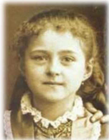
8 yrs. old