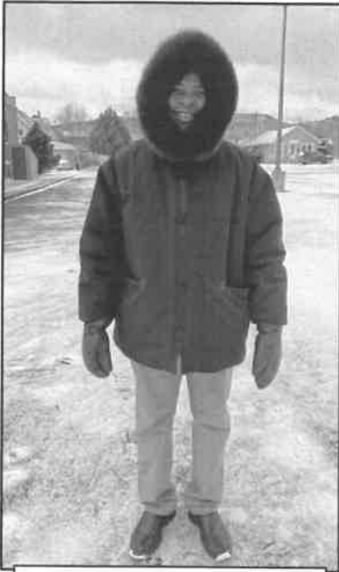
Out for a stroll around the neighborhood Wednesday.