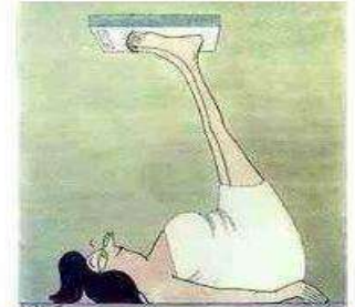
We must get the word out!