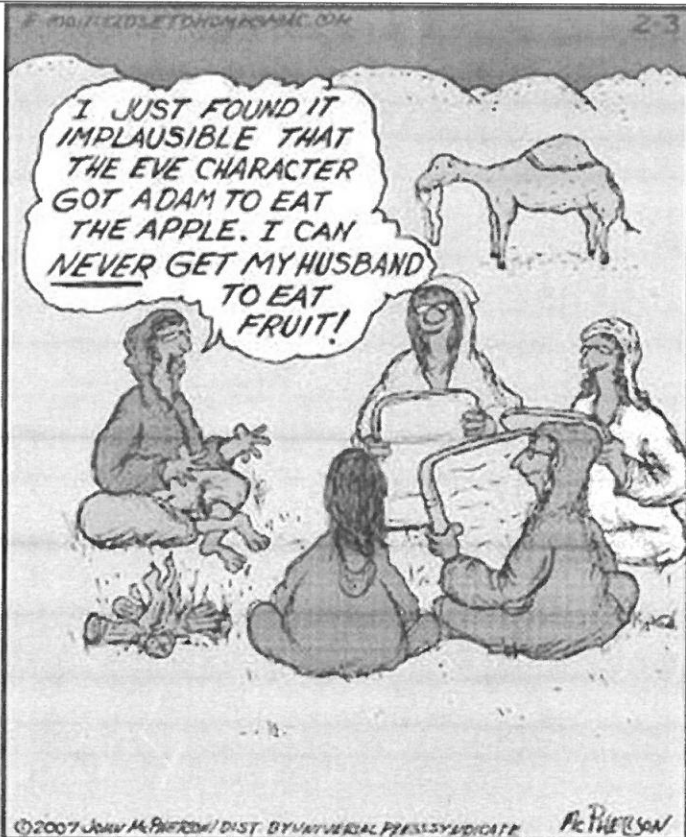
The world's first book club.