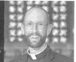
Live from the Cathedral of Our Lady of Perpetual Help June 29 at 11 a.m.

All are invited to attend in person! You may also watch on the Diocesan website: www.rapidcitydiocese.org and facebook page.